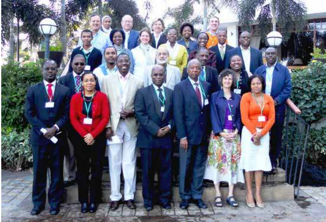
GARP-Mozambique leaders, African GARP collaborators and CDDEP colleagues at the working group launch.