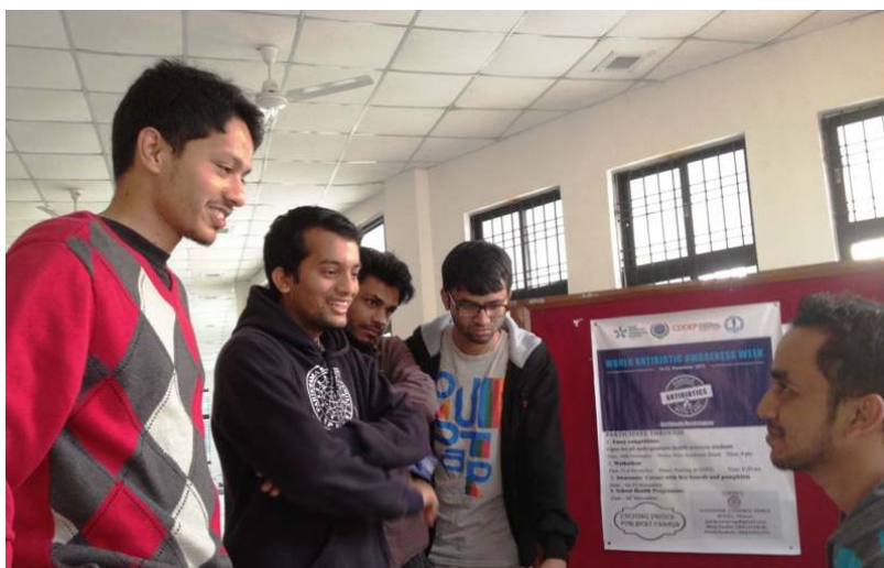
Students learn about AMR at World Antibiotic Awareness Week events in Nepal