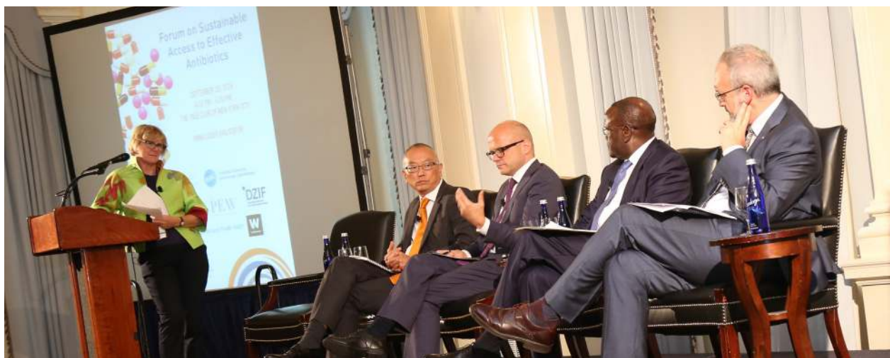
Professor Dame Sally Davies, Chief Medical Officer for the UK, moderating Panel 3 on Global Governance and Accountability. (See text for panelists.)