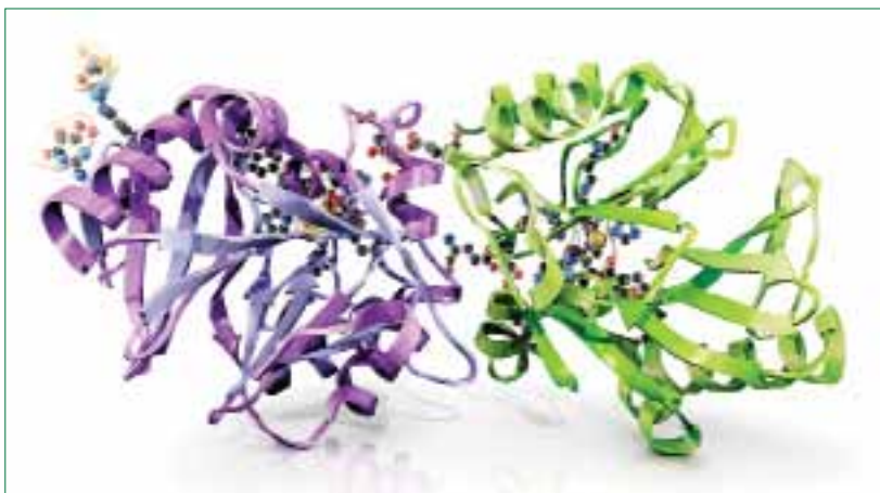
Figure 8: Potential targets of new drugs include resistance enzymes such as ESBLs

Among the more promising antivirulence targets are quorum sensing, type 3 secretion systems, toxins, and the biosynthesis of glycolipid surface structures. Quorum sensing refers to the production of diffusible small molecules by bacteria that act as autoinducers of various cellular factors at high cell densities. These compounds, such as homoserine lactones produced by Gram-negative