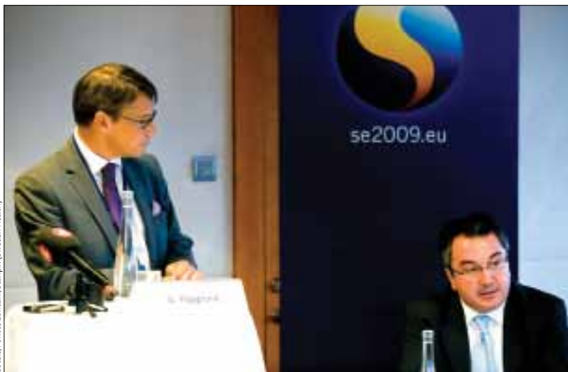
Figure 7: The Swedish Government, particularly Minister of Health Goran Hagglund, have helped define the problem of antibiotic resistance thus far

The infrastructure of antibiotic discovery in academia and the pharmaceutical industry has fallen to a dangerously low level. A prolonged loss of skills in both sectors means few people have experience of antibiotic discovery, especially of new classes. If a university or a company has no people engaged in antibiotic discovery, it is unlikely to produce new ideas in this area.