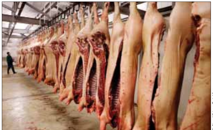
Figure 5: High standards of food processing can prevent contamination of food with bacteria

The detection of vancomycin-resistant enterococci with the vanA -gene cluster in animals in the EU triggered